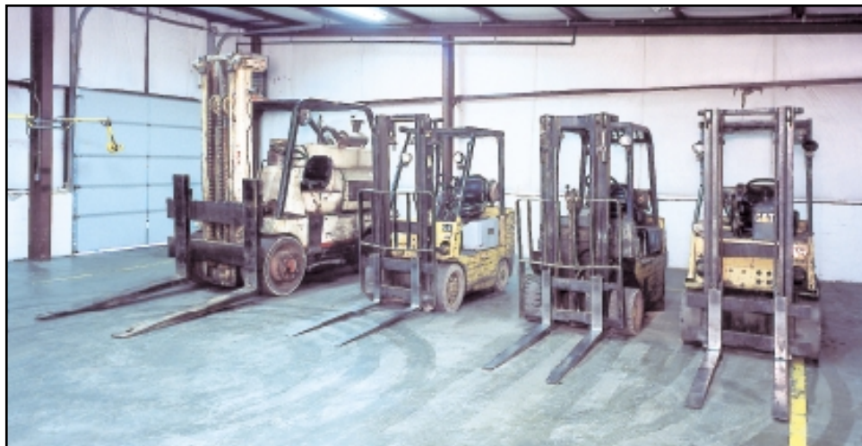
PARTIAL VIEW OF FORKLIFTS