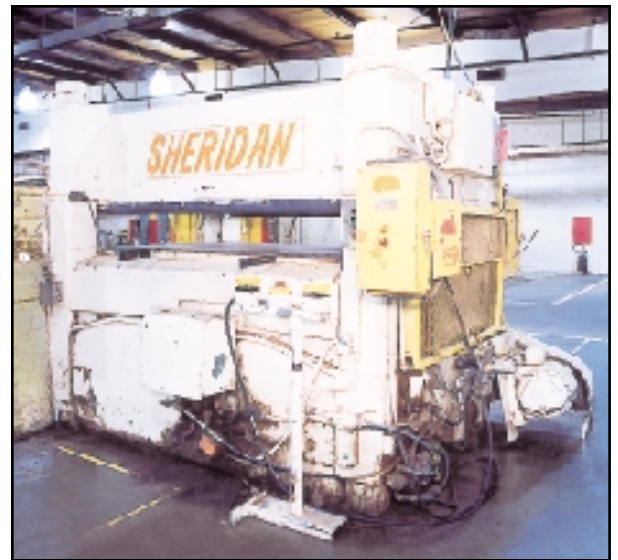
SHERIDAN MODEL 500 500-TON UP-ACTING MECHANICAL DIE CUTTING PRESS