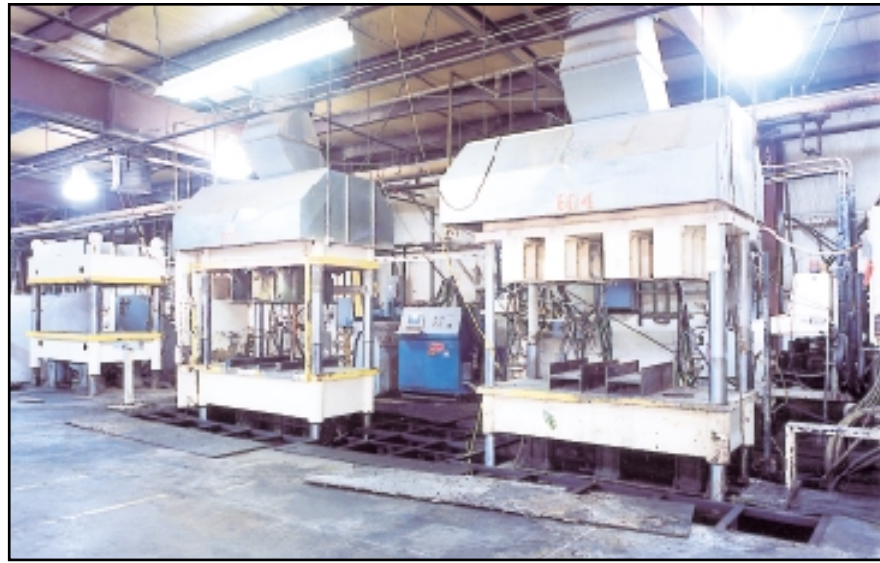
ST. LAWRENCE 600-TON 3-POINT UP-ACTING 4-POST HYDRAULIC PRESS