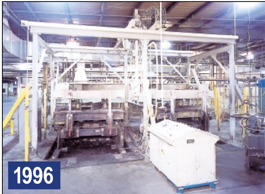
CANNON A-100 COMPUTERIZED POLY-150 METERING & FOAM APPLICATION SYSTEM