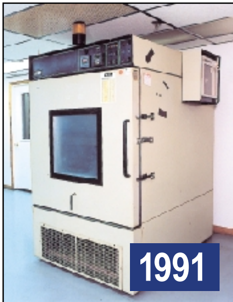
CINCINNATI SUB-ZERO 2H-32-2-2-H/AC ENVIRONMENTAL TEST CHAMBER