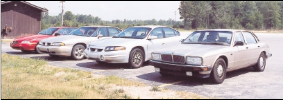
VIEW OF 4-DOOR SEDANS