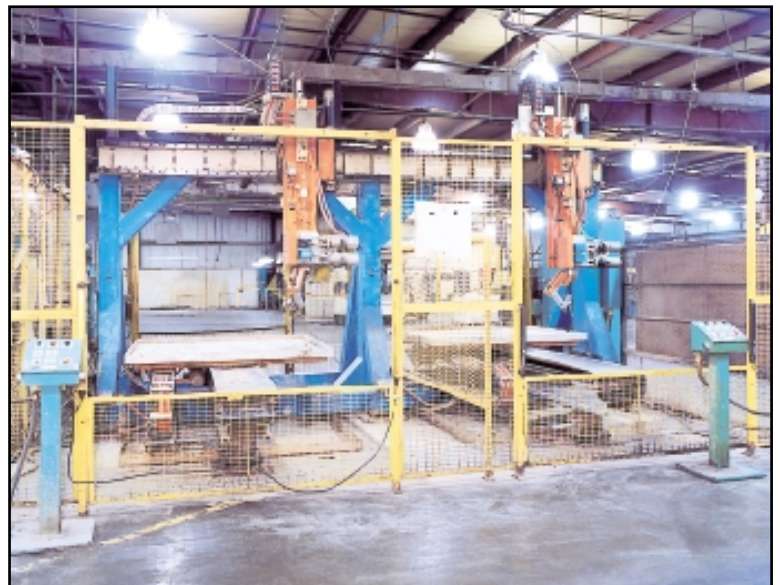
ASI 5-AXIS ACCUCCELL/DUAL ACCUCCELL 2-STATION GANTRY-TYPE WATER JET CUTTING MACHINE