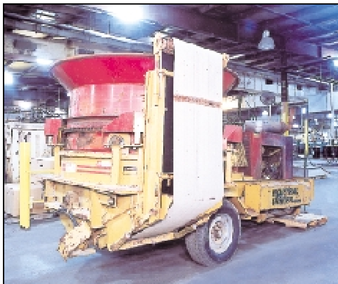
HAYBUSTER MODEL 1G-8 DIESEL TRAILER-MOUNTED TUB GRINDER