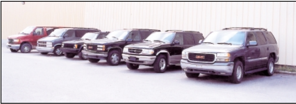
PARTIAL VIEW OF SPORT UTILITY VEHICLES AND MINI VANS