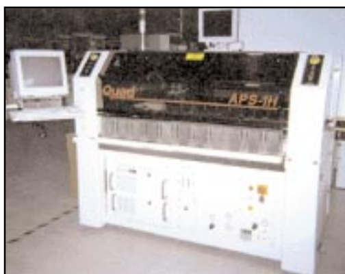
1 OF 2 QUAD APS-1H MICROPROCESSOR-CONTROLLED COMPONENT PLACEMENT MACHINES