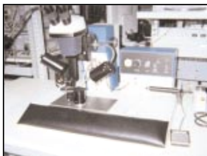
MEI MODEL 990 DIE BONDER