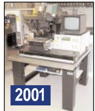
KARL SUSS TYPE 105425 MODEL MA6/BA6 MASK ALIGNER