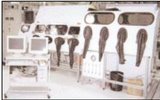
SOLID STATE EQUIPMENT VACUUM SEAM SEALERS