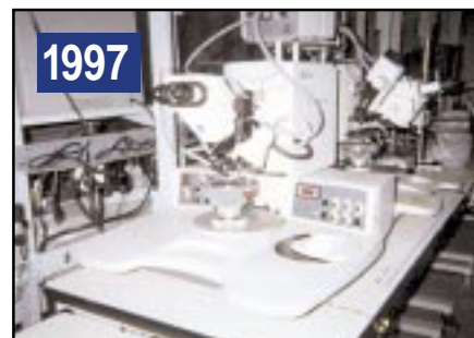
1997 1 OF 2 KULICKE & SOFFA MODEL 4526 WIRE BONDER