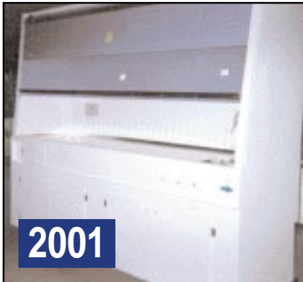
BLE HP-3 DUAL-STATION SOFT BAKE MODULE