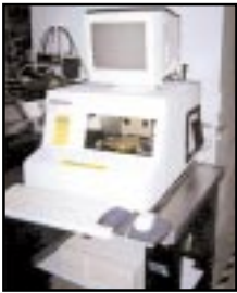
KLA-TENCOR MODEL P-11 SURFACE PROFILER