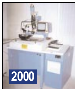
1 OF 3 PALOMAR 2470-V AUTOMATIC WEDGE BONDERS