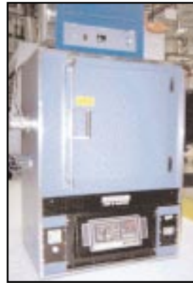
LINDBERG/BUE-M MO-1490A1 BENCH-TOP LAB OVEN