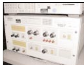
1 OF 2 AGILENT MODEL 70843B 0.1-12-GBIT/S ERROR PERFORMANCE ANALYZERS