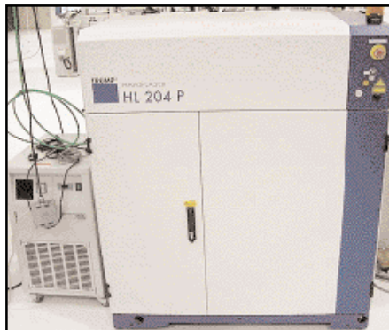
TRUMPF MODEL HL-204-P HAAS LASER