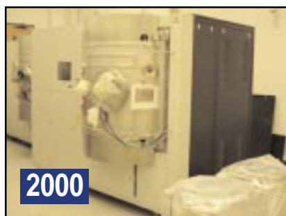
1 OF 3 VEECO SPECTOR CONVERTIBLE OPTICAL DEPOSITION SYSTEMS