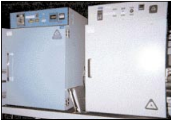
ASSOCIATED 24" X 24" X 24" BENCH-TOP ENVIRONMENTAL TEST CHAMBERS