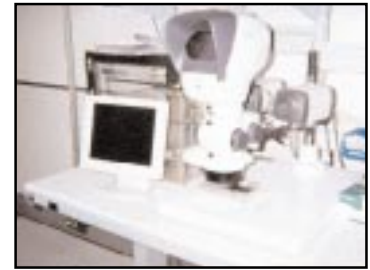
1 OF 3 LYNX VISION DYNASCOPES