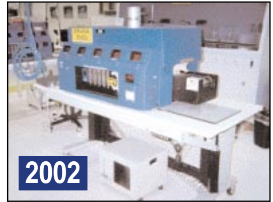
1 OF 2 SIKAMA FALCON 5C 7.68-KW 4-ZONE CONTINUOUS CONDUCTION/CONVECTION OVENS