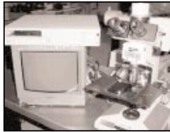
BOECKLER-OLYMPUS MODEL BX51 STEREO TURRET INSPECTION MICROSCOPE