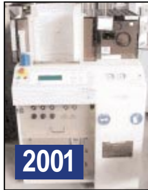
CREATIVE AUTOMATION CHAMPION-3700 EPOXY DISPENSER