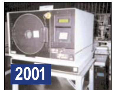
1 OF 2 AXIC MODEL HF-8 MULTI-MODE BENCH-TOP PLASMA REACTORS

To view a complete asset list, visit our website @ www.dovebid.com