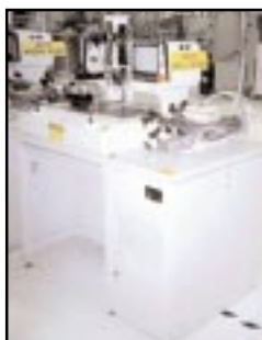
PALOMAR MODEL 2460-V BALL BONDER