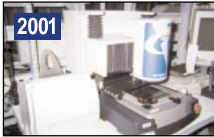
2001 OPTICAL GAGING PRODUCTS SMARTSCOPE FLASH OPTICAL MEASURING SYSTEM