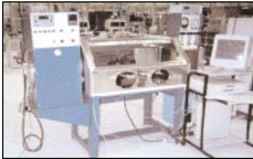
PYRAMID ENGINEERING SERVICES VACUUM SEAM SEALER