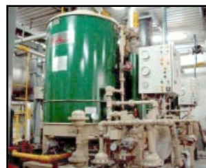
Equipos de Tratamiento de agua y Generación de Vapor / Water & Steam Equipment