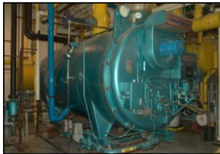
Cleaver-Brooks 250-HP Package Boiler

(2) Kaeser DS-140 100-HP Skid-Mounted Toolroom Equipment; Pickup Truck; 18,000-Skid Pallet Rack Storage System; (23) Electric Forklifts; Pallet Jacks; Pallet Wrapper; Repair Parts, Etc.