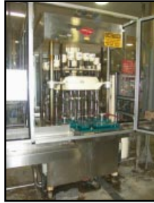
MRM/Elgin 24-Station Filler