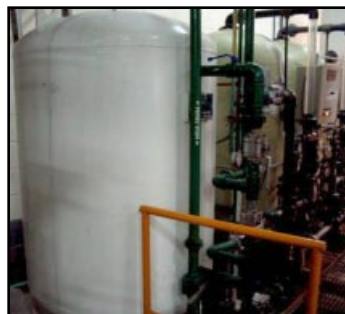
Tanques Mezcladores de Acero Inoxidable / Mixing Tanks