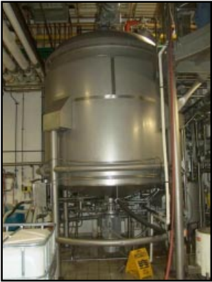
2002: Tetra Pak 10,000L Stainless Steel Jacketed Vacuum Mixing Tank