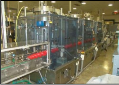
Rationator FRUKO 1/12 12-Station Filler