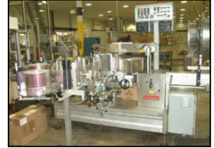
Accraply 35-PW Labeler