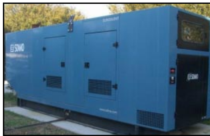
SDMO 400kW Diesel Standby Generator