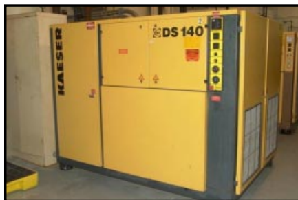
Kaeser DS-140 100-HP Air Compressor