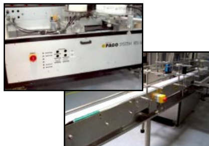
Equipo de Envasado / Packaging Lines