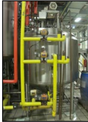
1999: Feldmeier 4911 1000L Stainless Steel Jacketed Vacuum Mixing Tank