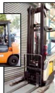
Crown 3650-Lb. Montacarga