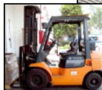
Toyota 4800-Lb. LPG Montacarga