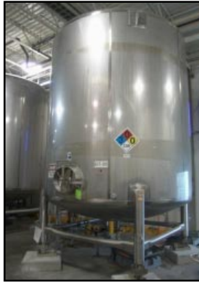
2000: Feldmeier Equipment 29,870L Stainless Steel San Batch Tank