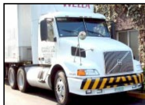
Volvo Tractocamiones, 2000 / 2000 Volvo Highway Tractor