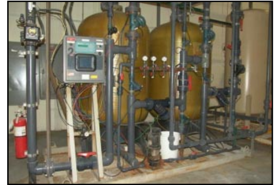
Lakeside 2-Bed Deionizer DI Water System