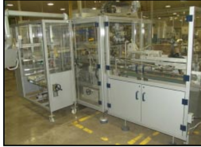
2003: Skinetta Pac-System CP-150 Case Packer